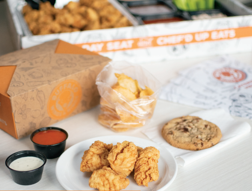
BONELESS WING BOX LUNCH WITH SARATOGA CHIPS & COOKI