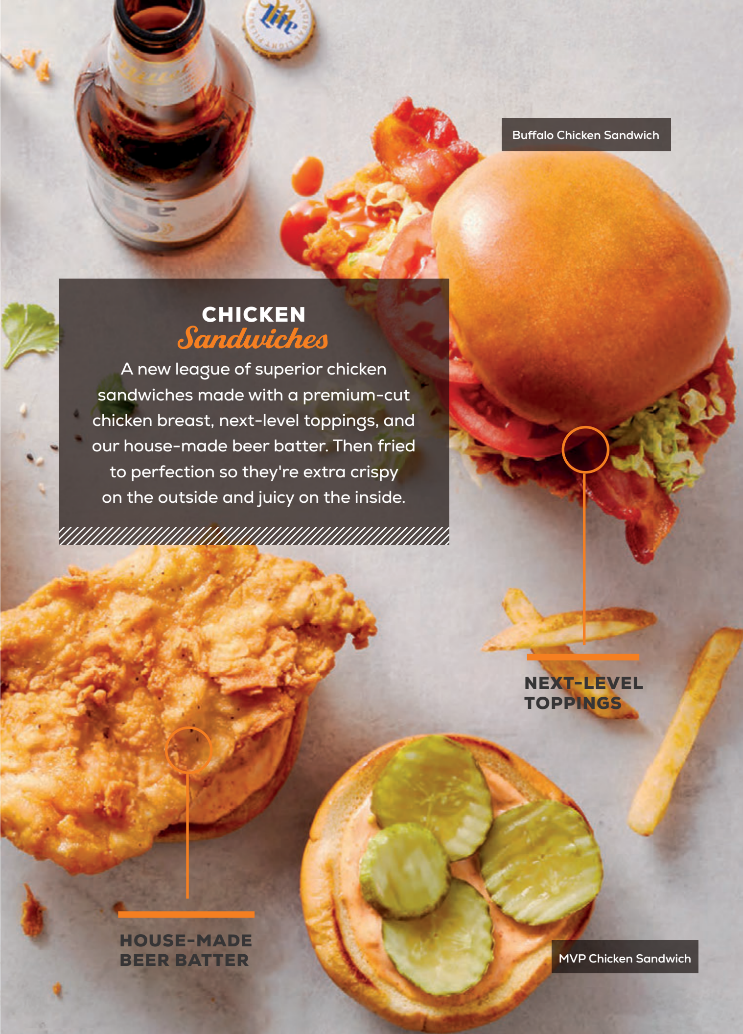
MVP Chicken Sandwich