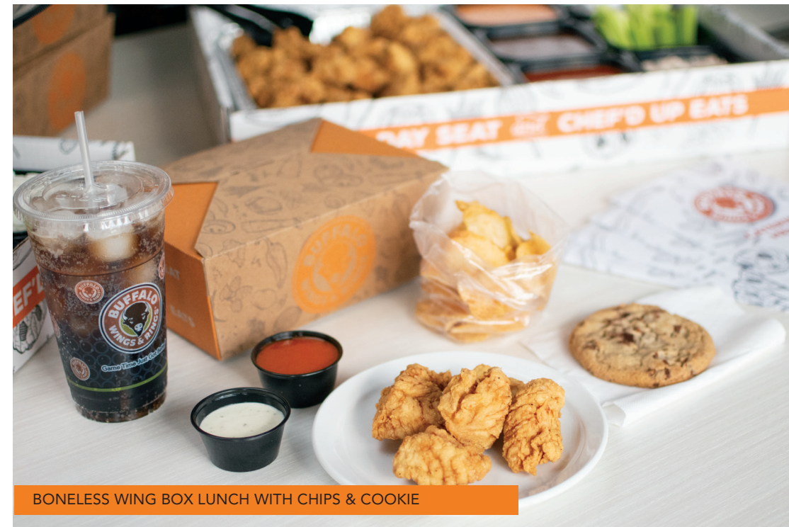
BONELESS WING BOX LUNCH WITH CHIPS & COOKIE