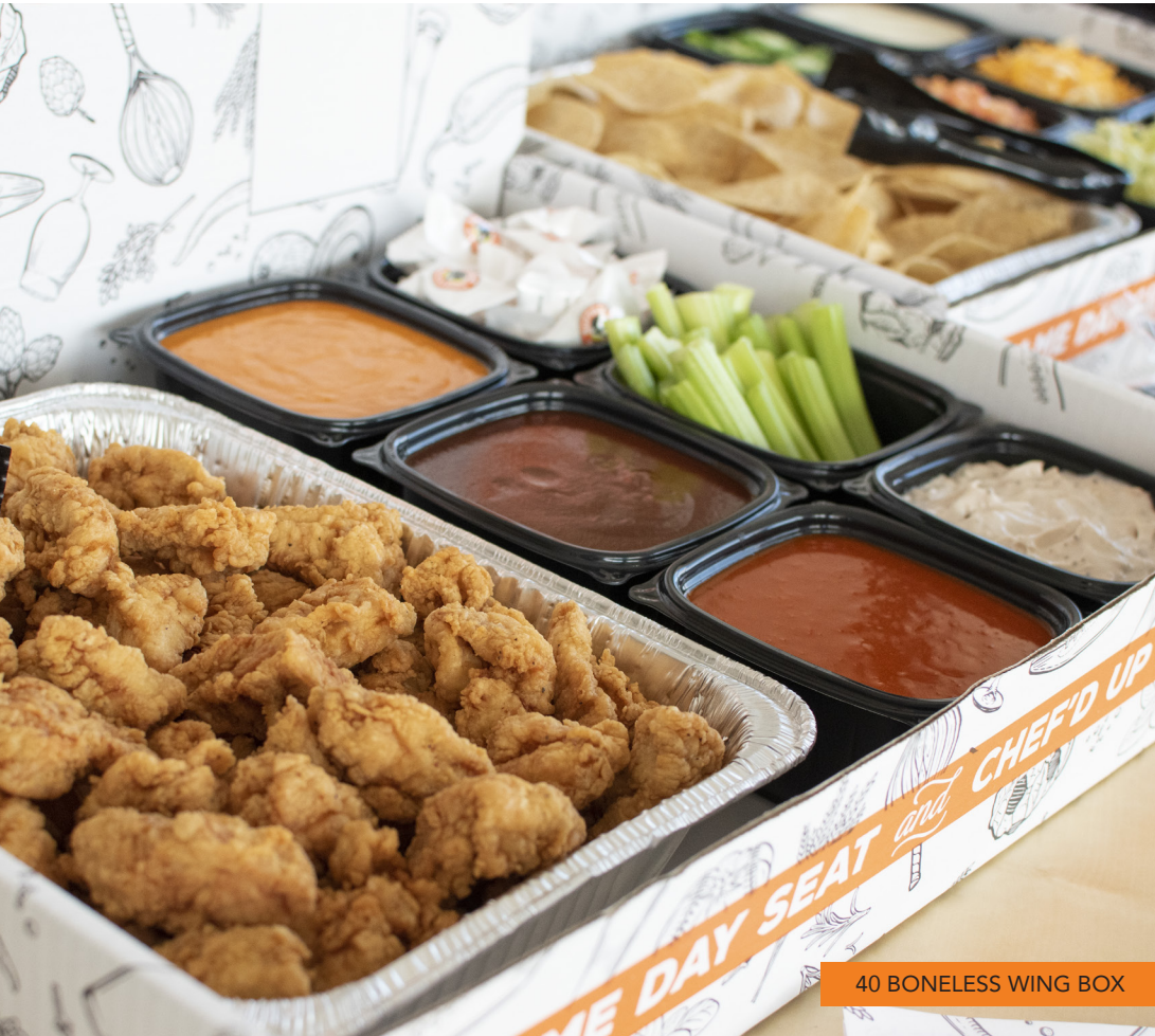
40 BONELESS WING BOX

Boneless grilled available upon request.