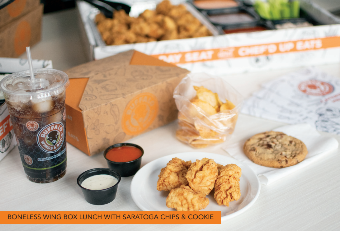
BONELESS WING BOX LUNCH WITH SARATOGA CHIPS & COOKIE