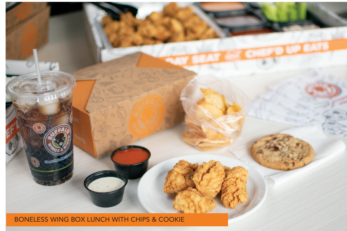
BONELESS WING BOX LUNCH WITH CHIPS & COOKIE